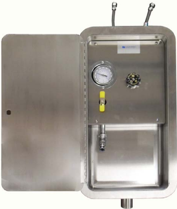
LEFT HAND DOOR SHOWN

Thermostatic Mixing Valve Station for Dialysis Applications. This special system provides controlled low flow water temperature for dialysis using a Leonard TAP thermostatic water mixing valve, powered by the DURA-trol® solid bimetal thermostat. The mixed water outlet assembly includes an atmospheric vacuum breaker, dial thermometer, ¼ turn ball valve and quick coupler with dust cover. The unit is mounted in a type 316 stainless steel cabinet with door and flange and panel for the mixing valve assembly. The unit is factory assembled and tested by the Leonard Valve Company, Cranston, RI.