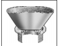
EG-(*) (*) Denotes Strainer Finish (-1, -3 or 50)