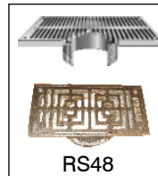
RS(*)-(**) (*) Denotes Strainer Size (4"x8", 4"x12", or 5"x17") (**) Denotes Strainer Finish (-1 or -3) (-3 only for 5" x 17")