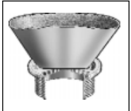
EG-(*) (* Denotes Strainer Finish (-1, -3 or 50))

F1100-EG Series meets ANSI-ASME floor drain standard A112.6.3-2001