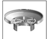
ER(*) (*) Denotes Strainer Finish (-1, -3 or 50)

F1100-ER Series meets ANSI-ASME floor drain standard A112.6.3-2001