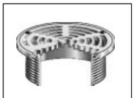
(*)-(**) (*) Denotes Strainer Diameter (7" or 9") (**) Denotes Strainer Finish (-1, -3 or -4)

F1140C Series meets ANSI/ASME floor drain standard A112.6.3-2001