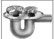
F1140C(*)C (*) Denotes Outlet Size