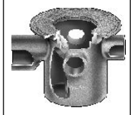
F117(*) (*) Denotes Outlet Size