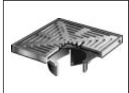
F1440-TA(*) (*) Denotes Strainer Finish (-1, -3 or -4)

F1450 Series meets ANSI/ASME floor drain standard A112.6.3-2001