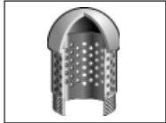
W-31-PERF and F1830-PD-3