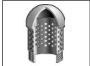
W-31-PERF and F1830-PD-3