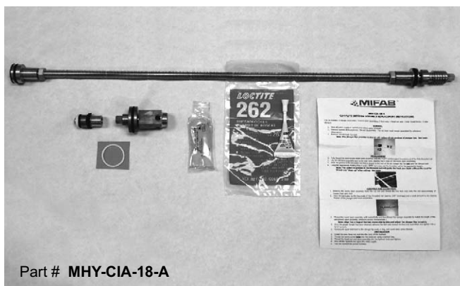
Part # MHY-CIA-18-A

Install the new head nut seal into the body of the hydrant. Thread the worm screw fully into the head nut using a hydrant key. Thread the head nut and stem assembly into the hydrant body and tighten. Shut off the hydrant and open the water supply. Test the hydrant for proper function.