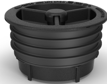
Z1072 ZShield Barrier Trap Seal Available in 2", 3", 3-1/2", 4"

Discover the paired performance of the ZShield and EZ1™ Technology. The leading drain manufacturer now offers the easiest to install barrier trap, the ZShield minimizes evaporation, preventing odors, gases, and insects from entering up through the drain.