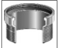
DD-(*) (*) Denotes strainer finish (-1, -3 or -50)