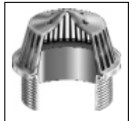
K- (*) (*) Denotes Strainer Finish (-1 or -3)