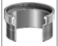
DD-(*) (*) Denotes strainer finish (-1, -3 or -50)

F1100-DD Series meets ANSI-ASME floor drain standard A112.6.3-2001