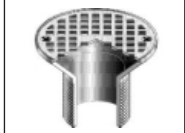
4-(* (* Denotes Strainer Finish -1, -2 or -49)