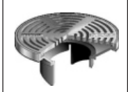
F1340-TA-(*) (* Denotes Strainer Finish (-1, -3 or -4)

F1340 Series meets ANSI/ASME floor drain standard A112.6.3-2001