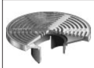
F1360-TA-4 (*) Denotes Strainer Finish (-1, -3 or -4)

F1370 Series meets ANSI/ASME floor drain standard A112.6.3-2001