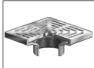
F1420-TA-4 (*) (*) Denotes Strainer Finish (-1, -3 or -4)