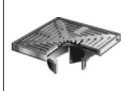
F1440-TA- (*) Denotes Strainer Finish (-1, -3 or -4)

F1440 Series meets ANSI/ASME floor drain standard A112.6.3-2001