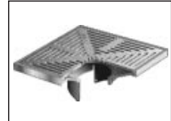
F1460-TA-4(*) (*) Denotes Strainer Finish (-1, -3 or -4)

F1470 Series meets ANSI/ASME floor drain standard A112.6.3-2001